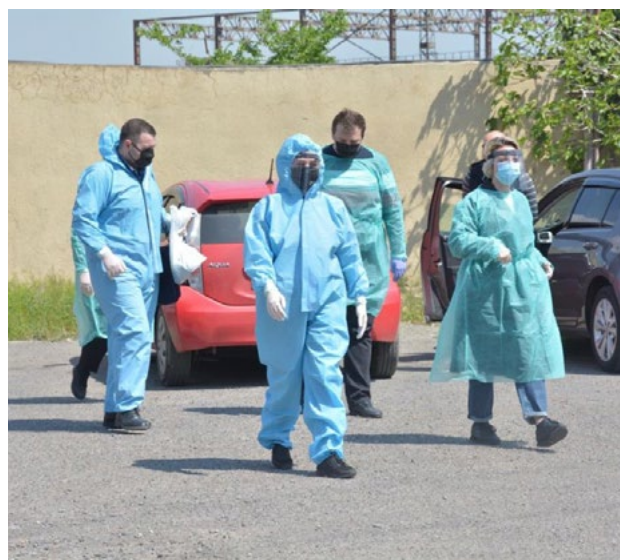
Monitoring Visit by the Office of Public Defender of Georgia

From the very beginning of the COVID-19 pandemic the Public Defender of Georgia has stressed the need to make information accessible to vulnerable groups. Public Defender also applied to the relevant state agencies to ensure the protection of the rights of persons with disabilities with recommendations concerning distance learning, accessibility of information, continuity of disability targeted rehabilitation programs, preventive measures in 24-hour daily care houses, etc. Public Defender also addressed the government to include sufficient social protection for persons with disabilities in the Anti-Crisis Economic Plan. Additionally, Public Defender organized an Online Conference concerning continuity of disability targeted rehabilitation programmes during the COVID-19 pandemic. See here .